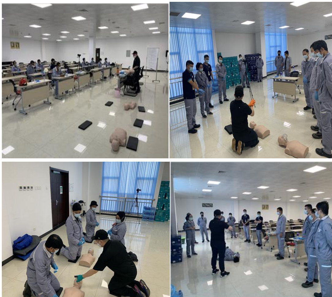
Practice Make Perfect 实践出真知

医疗急救员培训分理论学习及实践培训两部分进行，理论培训部分 HSE 培训专业在 8 月 3 日通过企业微信培训群提前发布培训视频让各部学员下载自行学习；10 日医疗培训中心 JO 讲师以 VoovMeeting 视频会议的形式对第一批次的 24 个参训人员进行集中授课及解答，加强培训效果；首批次的 24 个参训人员再以 12 人为一组，完成个人健康状况评估及 ART 自测结果正常后，参训人员进场公司 101 培训室，分别在 11 日及 12 日完成实践课目的培训及现场考评。