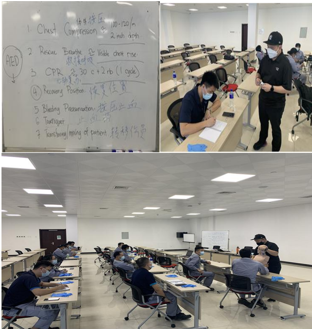
Focus on participation in the training , and the lecturer answered on the spot 学员认真参训，讲师现场解答

The 24 trainees in the first batch of the company's medical first aid training in 2022 were enthusiastic about learning, listened carefully to the lecturer's explanation, and actively asked questions. All trainees passed the theoretical and practical training and evaluation; the second and second batches of medical first aid training They will be held on August 16-18 and 23-25 respectively.