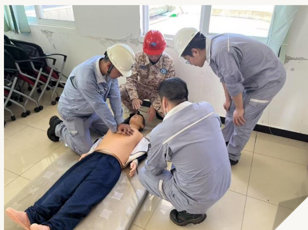
CPR Exercise CPR 实操