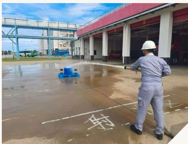
Two-person, Two-hose Water Target Shooting Exercise 两人两盘水带射水打靶实操