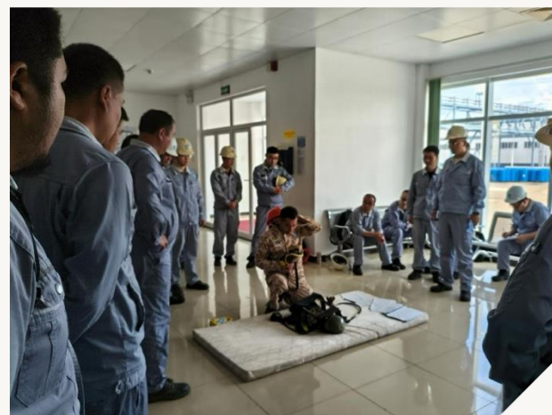
Self-Contained Breathing Apparatus (SCBA) Exercise 佩戴正压式空气呼吸器实操

Organize risk source identification and assessment training for all departments, incorporating real production cases to explain in detail the key safety operation points, precautions, and common accident prevention and handling methods for each stage of the production process