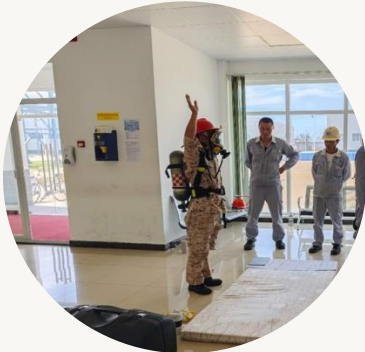
Self-Contained Breathing Apparatus (SCBA) Exercise 佩戴正压式空气呼吸器实操