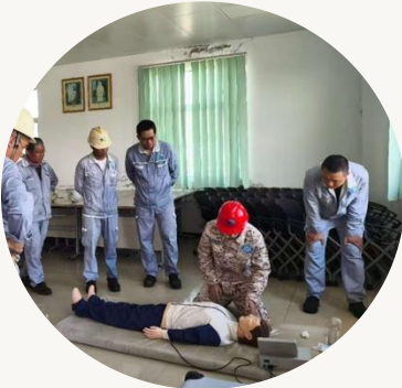
CPR Exercise CPR 实操