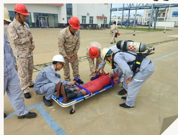
Casualty Transfer Exercise 伤员转移实操