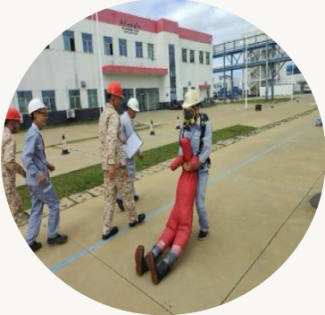
Casualty Transfer Exercise 伤员转移实操