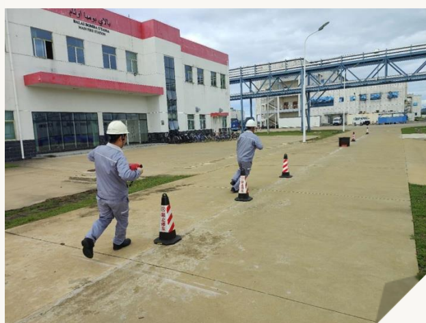
60m Obstacle Fire Extinguishing Drill 60米障碍灭火实操