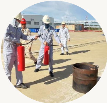
60m Obstacle Fire Extinguishing Drill 60米障碍灭火实操