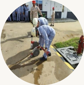
Two-person, Two-hose Water Target Shooting Exercise 两人两盘水带射水打靶实操